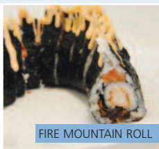
FIRE MOUNTAIN ROLL